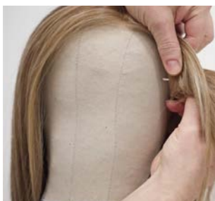
STEP 1: Secure wig with 2" T-pins.

EnvyHair's fiber memory locks in as it cools to hold its style longer—whether its air- or blow-dried (using medium heat and the Cool Shot button).