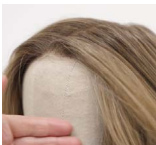
STEP 1: ESTABLISH PART on left side.

More durable than 100% human hair, ZOEY's heat-friendly EnvyHair™ blend cuts styling time in half—and can go curly, wavy and back to straight again.