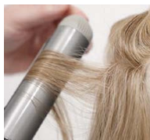
STEP 4: Release top section.

STEP 3: On lower section, USE A 1 3/4" CURLING IRON SET TO 285°F (140° C) and iron in waves in 1" x 3" vertical sections, leaving the ends out.