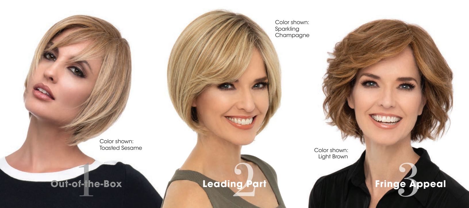
Color shown: Sparkling Champagne